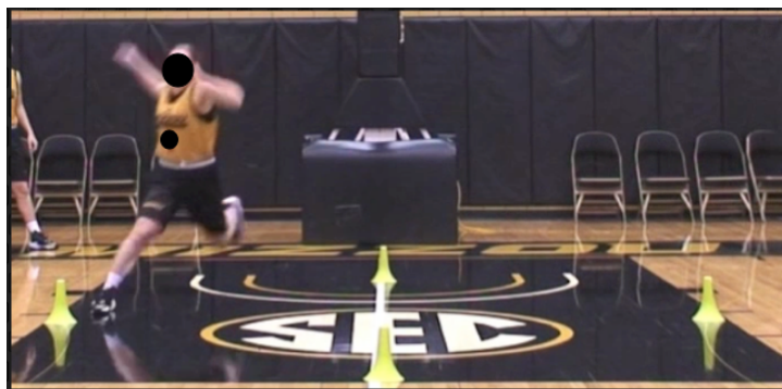
figure 3. Over-reaching with single-leg bounding. Note that foot is far outside of athlete's base of support, foot is flat on floor and knee is near full extension.

change direction they cannot "unstick" their flat foot from the floor because they are so far outside their base of support. As the change of direction occurs the foot stays planted on the ground facing one direction while the rest of the body pivots in the opposite direction. The culmination of these coupled motions often results in an ACL tear.